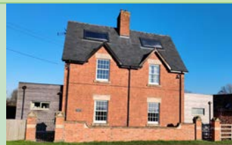
Retrofitted house on Standish Lane

The Stonehouse Community Climate Action Forum (SCAAF) is planning a second Climate Fayre on Sunday 3rd April, 11am-3pm at the Stonehouse Community Centre, Laburnum Walk GL10 2NR. Severn Wye Environmental Agency and various other environmental groups will be represented and able to advise on a wide variety of climate friendly initiatives e.g. solar energy, EVs, home retrofitting insulation etc. The last SCCAF Climate Fayre was very well received and attended by many local people. There will be refreshments!!