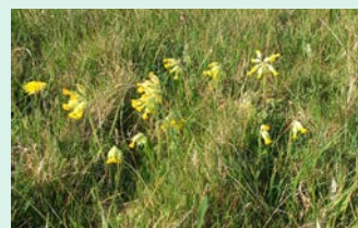
Some lovely local cowslips

Did you know that there are male and female cowslip flowers? In healthy cowslip populations, there are equal numbers of both types of flower. However, this 50:50 ratio becomes imbalanced when the cowslip population declines, due to loss of habitat or if there is a change in agricultural practices.