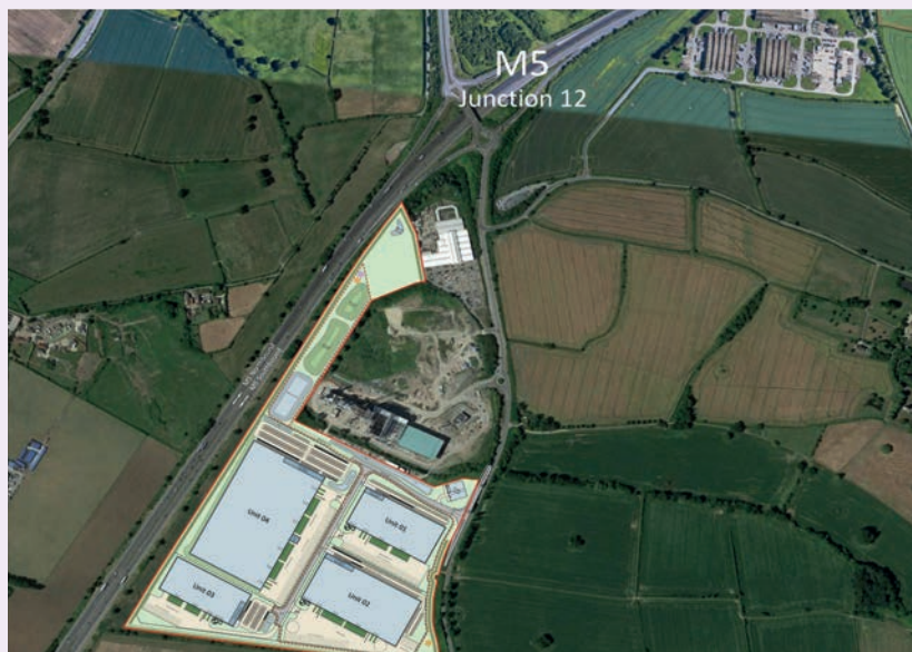
The Symmetry Park site

In 2021, the Parish Council learnt of a planning application coming forward for land named the 'Javelin Park extension site' in the emerging Stroud Local Plan and identified for employment use. The planning application - S.21/2579/OUT - and now referred to as Symmetry Park, has recently been submitted and can be viewed on the SDC planning portal. The Parish Council, together with a number of Standish residents, is very concerned at the size and scale of the proposed plans for a distribution and energy centre, together with its impact on the road network. We made a pre-application submission, expressing concern about the impact on Standish's historic environment and the natural environment (including the Standish Airfield Meadow). We also made clear our concerns about the impact on the B4008 and Junction 12, given that 1,300 jobs (and therefore, we may assume, a huge increase in car and lorry journeys) are proposed for the site. The largest units will be 34 metres in height. If this is difficult to envisage, it might help to know that the tallest buildings on the St Modwen's site are 15 metres - less than half the height - yet even these buildings have a significant impact on the landscape and character of the rural fringe of Gloucester. The proposed Symmetry Park buildings would certainly have a visual impact on the historic centre of Standish.