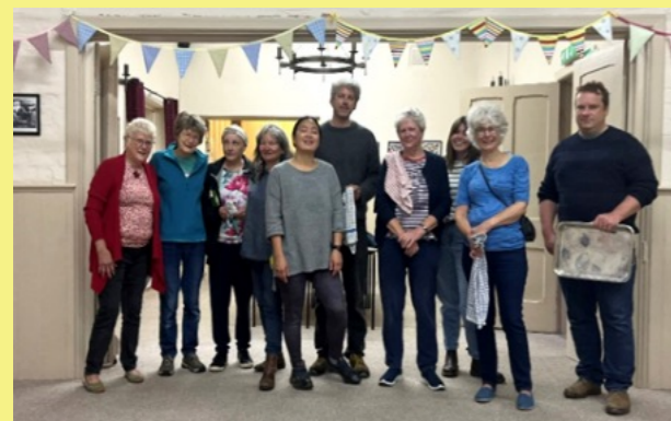
Harvest Supper volunteers and menu

If anyone would like to join the working group for a 2025 Harvest Supper, please contact me asap! AW