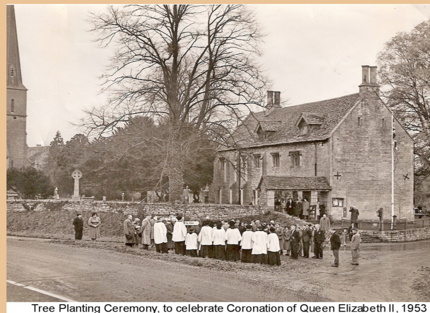
Tree Planting Ceremony, to celebrate Coronation of Queen Elizabeth II, 1953

Footprint information can guide us to where we should target our efforts to reduce emissions and have the greatest impact. To help us think about what to do next with our footprint information, in each section of the report there are change targets for reaching net zero, and some questions to help us think about possible areas for action. Details about retrofitting older properties can be found here https://severnwyke.org.uk/ including information about retrofit and installation support, heat pumps, solar panels, condensation, making your boiler more efficient, grants, energy surveys as well as 101 tips for an energy efficient lifestyle! https://severnwyke.org.uk/advice-support/resources-energy-efficiency-at-home/ ALISON WIDGERY